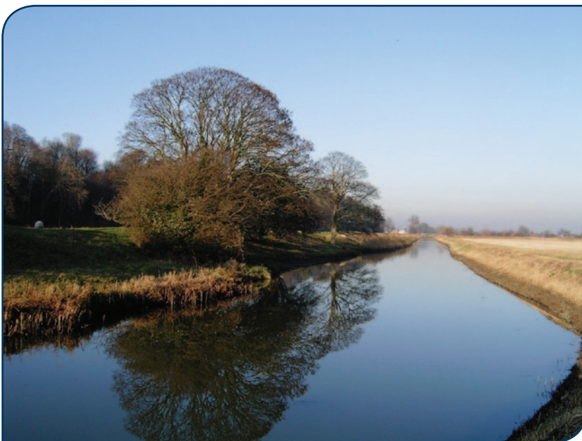
View along the Royal Military Canal