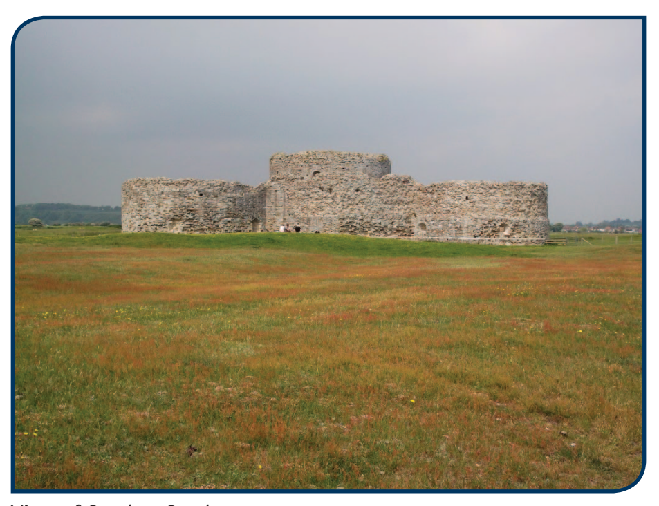
View of Camber Castle