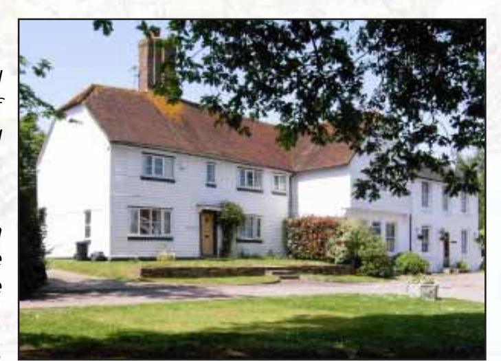
Local Weatherboarded Houses

Cross the main A28 opposite Broad Oak general stores, taking care on this busy junction. Continue to follow the route along Chitcombe Road to reach the Rainbow Trout pub and the end of the walk.