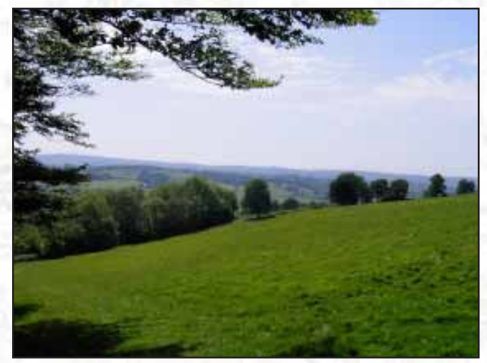
View from the Walk

Starting from the Rainbow Trout pub, turn left and follow Chitcombe Road for approximately 150 metres (165 yds.) before turning left onto the signposted footpath. Follow the path in the direction signposted along the edge of the field, and continue beyond, heading towards the farm buildings.