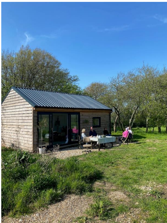
The Garden and studio at Blackwall Farmhouse, Peasmarsh