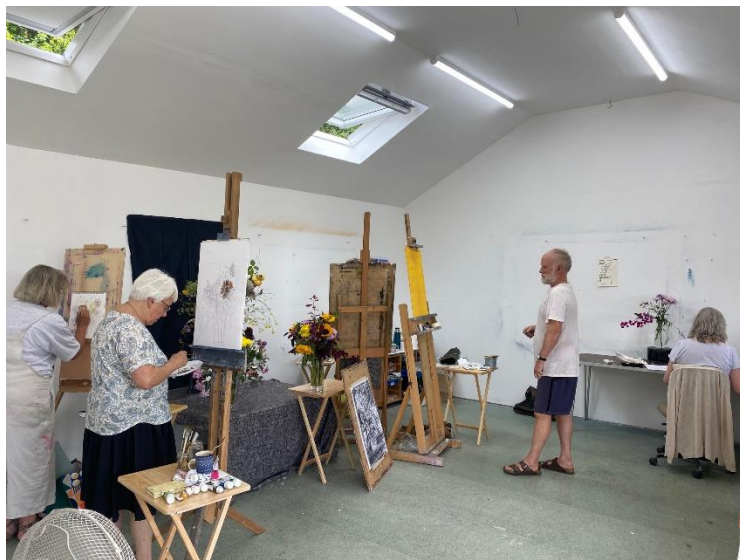
Images from last years 'flower' workshop